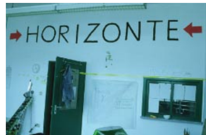
Anlagenstillstand (Plant Stand Still) Artist Curator/ Installation & Workshop, Erlangen, City Center, Germany 2002.