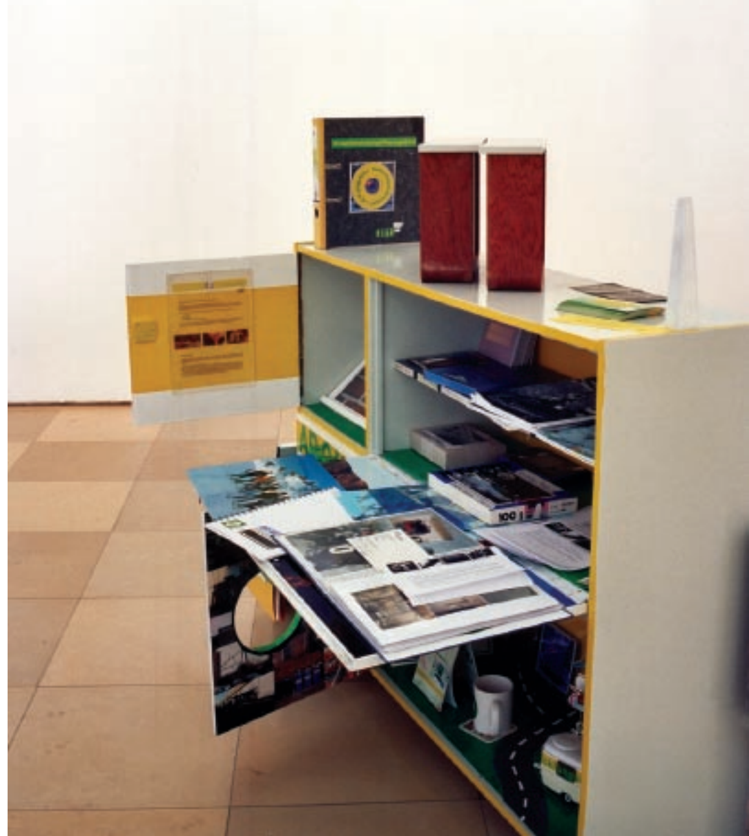
P.L.A.N. The Archive - Installation for the Bavarian Government Arts Prize, München, 2004.