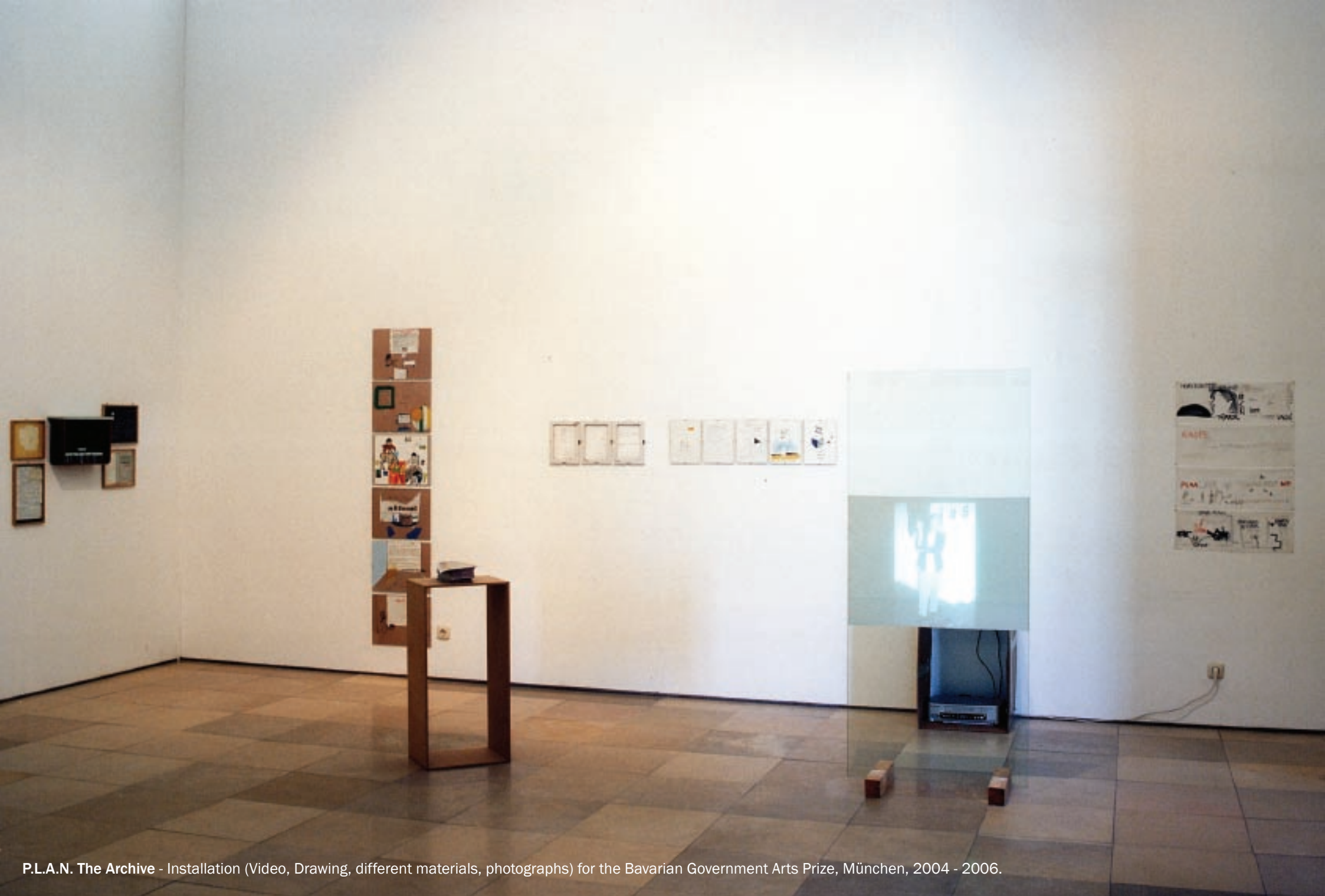
P.L.A.N. The Archive - Installation (Video, Drawing, different materials, photographs) for the Bavarian Government Arts Prize, München, 2004 - 2006.