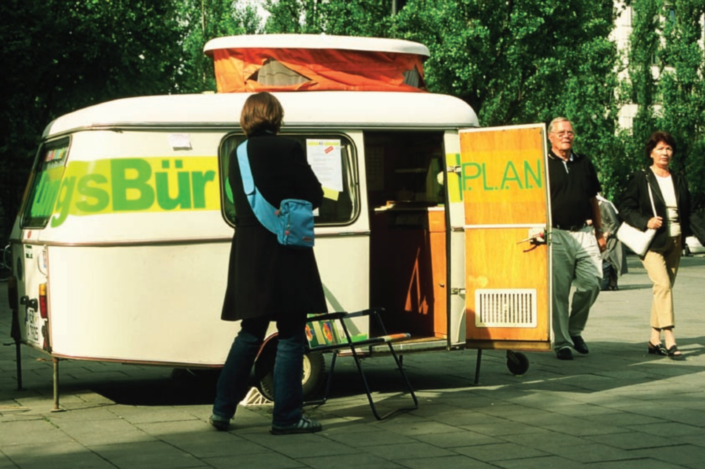
P.L.A.N. The mobile „Kulturentwicklungsplanungsbüro“ Installation, Performance, Concept, Ongoing since 2001.