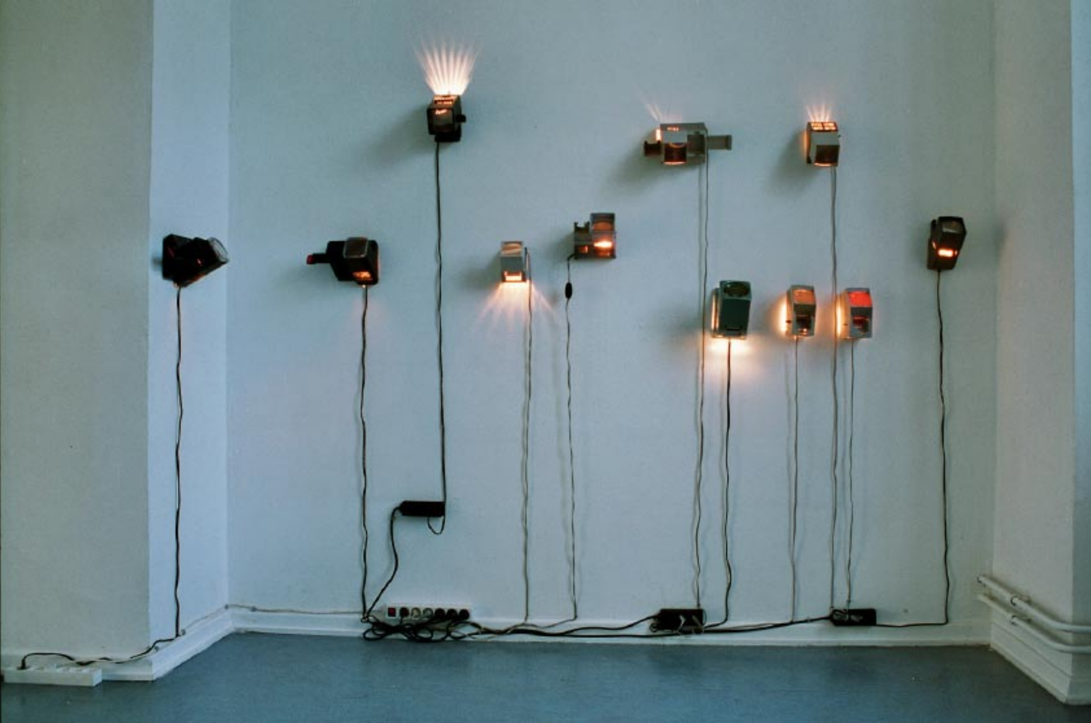
Fortgehen um fort zu gehen (Go away for creating progress) Installation (slideprojectors, Slides, bulbs), Kunsthaus Essen, 2006.