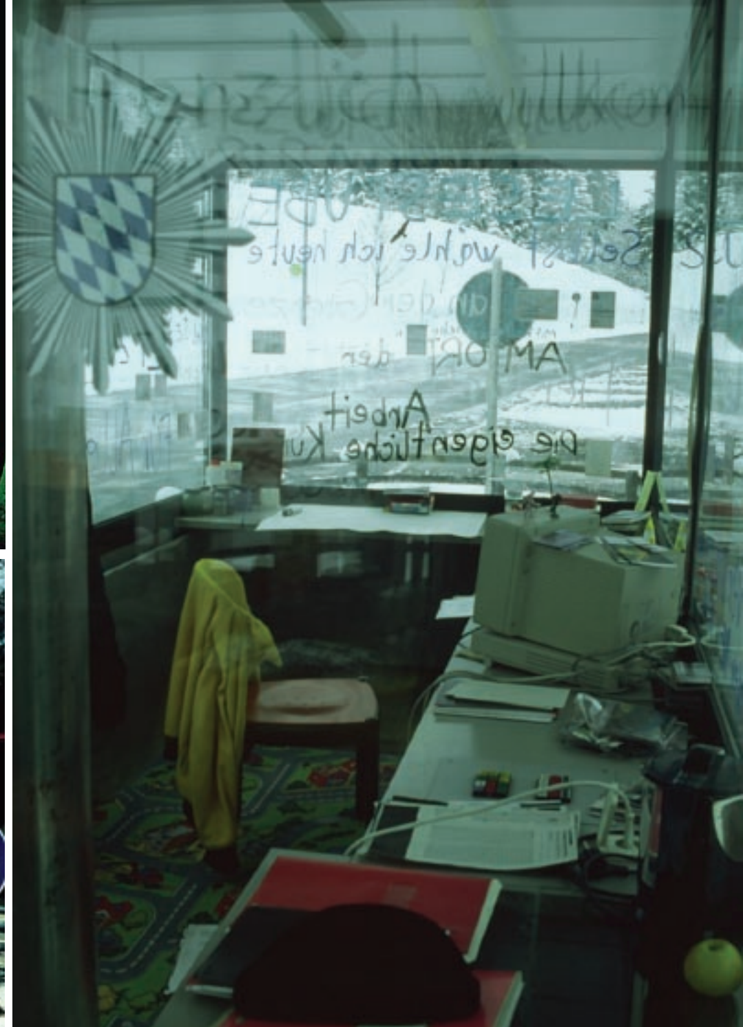
I choose my work place myself Installation at an abandoned frontier station, Austria/ Germany, 1999.