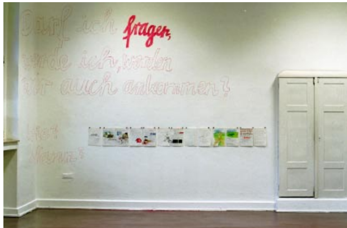
Fortgehen um fort zu gehen (Go away for creating progress) Installation (drawing, writing, tape, charcoal, binoculars, sideboard, color, cushions), Kunsthaus Essen, 2006.