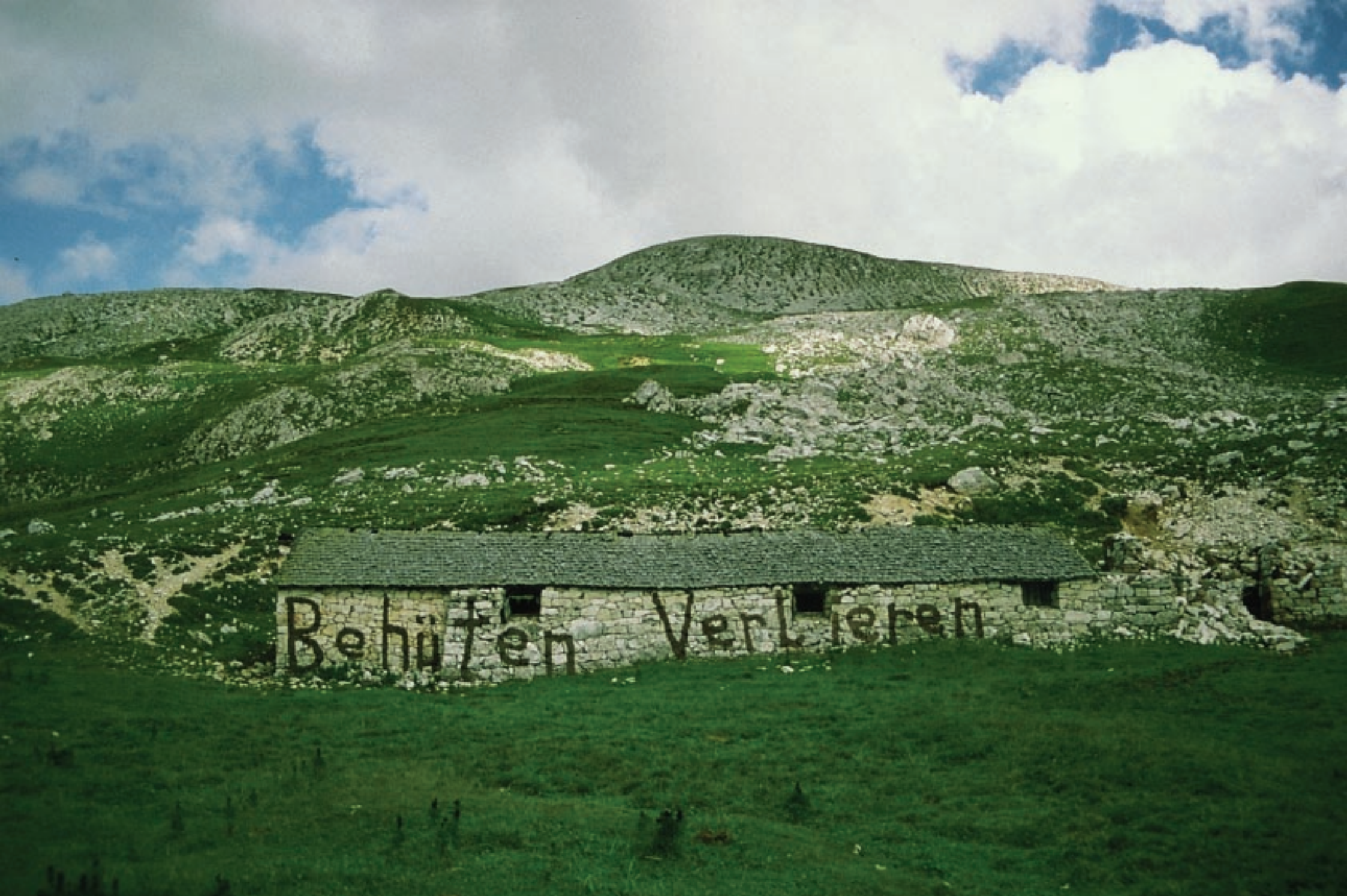
Behüten Verlieren (To look after - to loose) Installation (Clay on a barn, which is still in use) on the Schlern, Alps, Italy/ summer 1999.