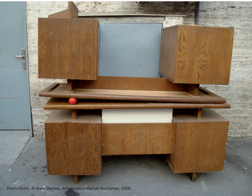
Erwin Wurm. © Anca Benera, Armeneasca Market Bucharest, 2008.